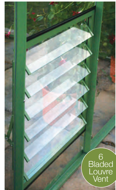
6 Bladed Louvre Vent