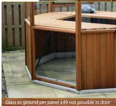
Glass to ground per panel £49 not possible in door