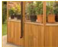
Guttering & downpipes