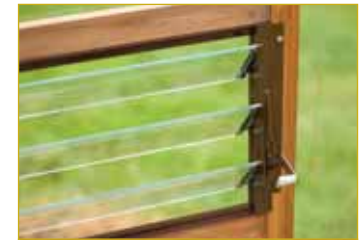
Optional Louvre mid level £107-£80