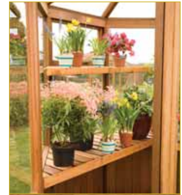
Staging & Shelving included

This makes the layout of the 6x6 Alton Octagonal very efficient as there is no wasted space.