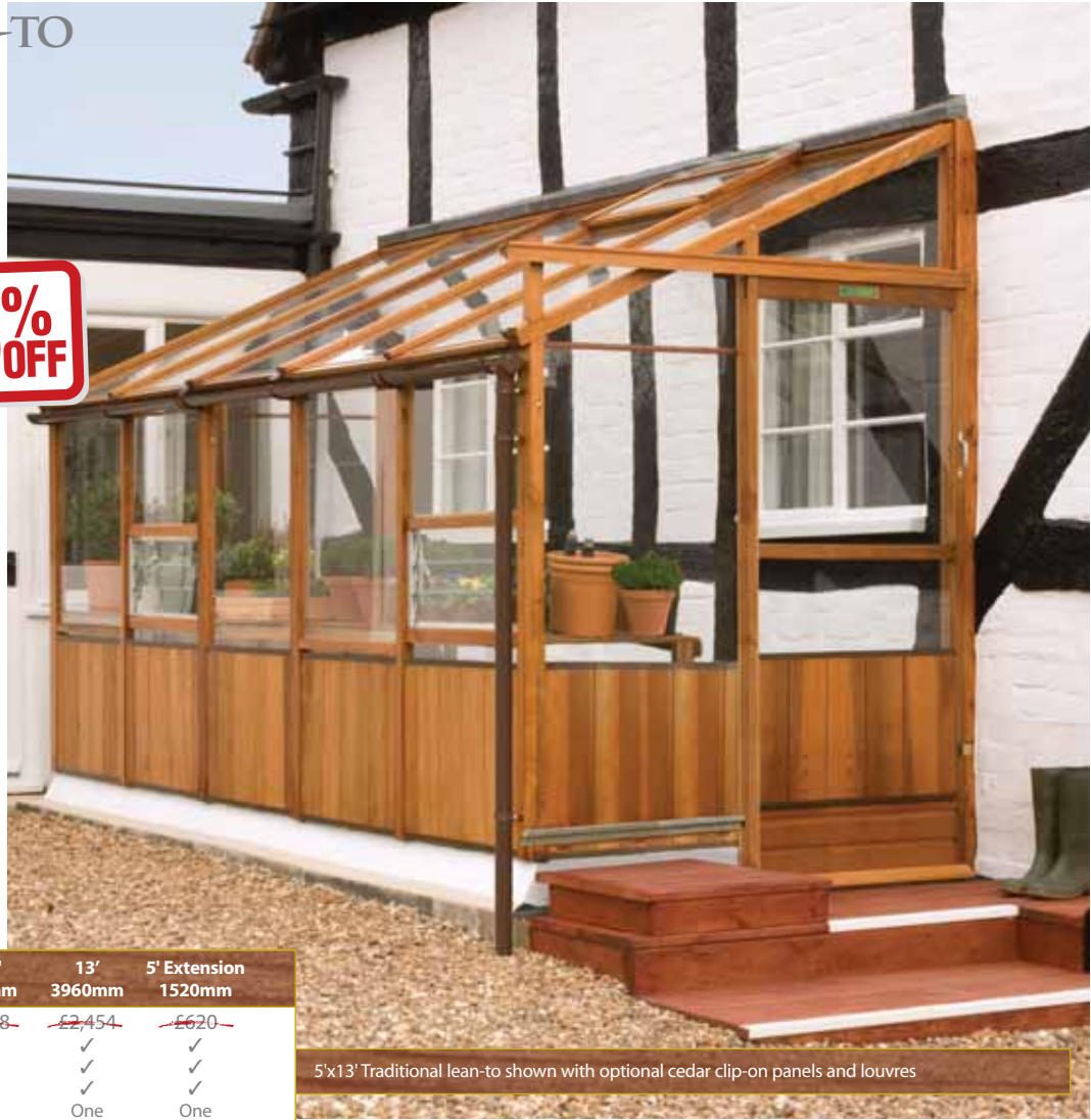
5'x13' Traditional lean-to shown with optional cedar clip-on panels and louvres