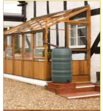
Extra door £329 £247