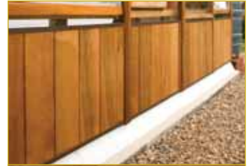
Optional cedar clip on panels