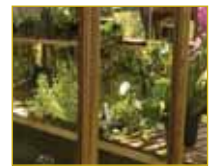
Toughened glass standard